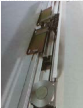
Ultra-thin door machine system