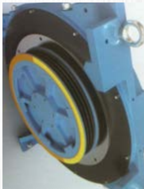
World's thinnest power-to-width motor body