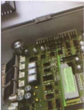
World's thinnest control panel